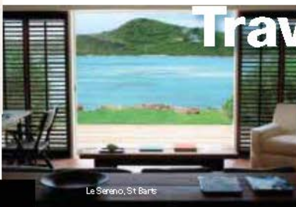
Le Sereno, St Barts